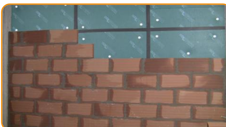
Build the second wall with the same process of the first one and insert the panel in the cavity