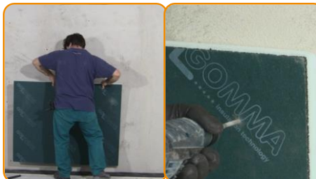
Place the panel on the right wall position and produce 5 holes per panel with the driller (one in the centre and one in the four corners)