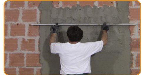
Apply in the first wall a layer of row mortar of about 1 cm thickness.