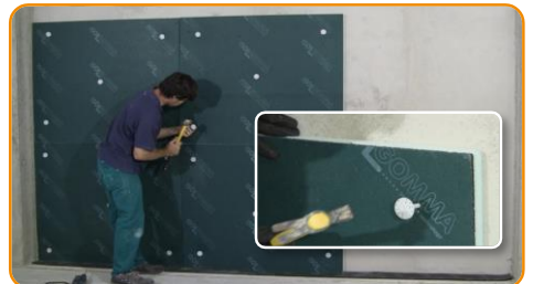
Apply the five plastic nails with the hammer.