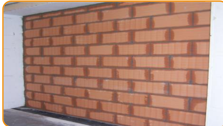
Build up the wall by caring to joint the blocks with mortar on both vertical and horizontal joints.