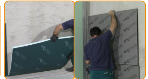
Apply the panel on the wall by forcing with homogeneous pressure.