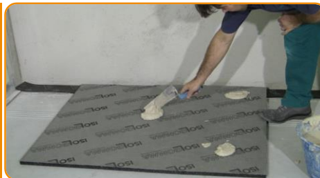
Apply the glue on the panel by spreading it on dots. (suggested glue Knauf Perfix)