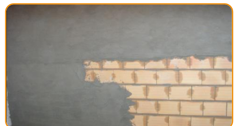
Realize the final plastering.