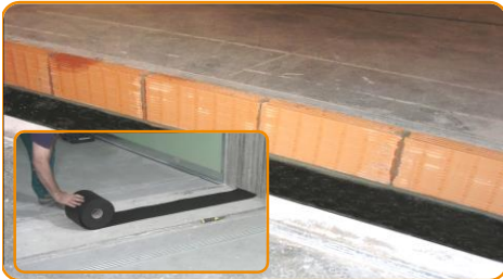
Lay the under wall strip in the dry floor. Build the wall.